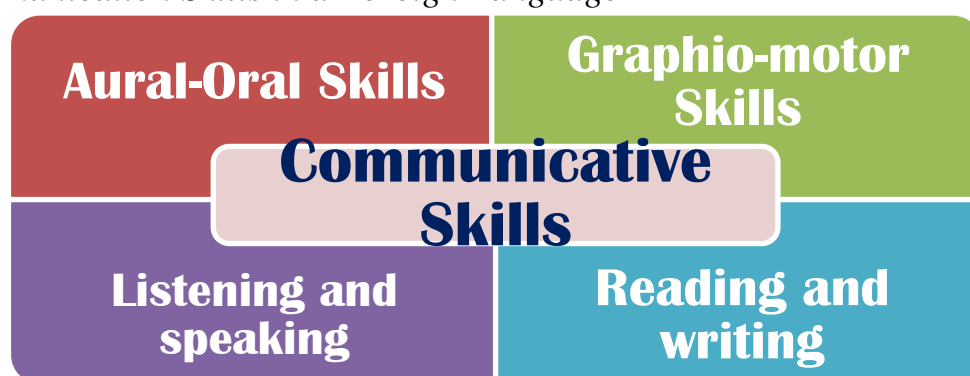
Communication Skills in a Foreign Language