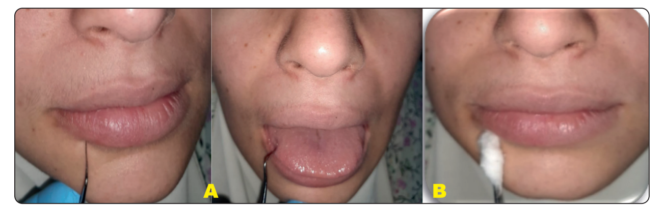
Fig. (3): Photographs demonstrating clinical neurosensory tests: (A) sharp/blunt discrimination test; (B) Light touch test (LT).

The study included six patients who had alveolar bone defects that were selected for alveolar bone