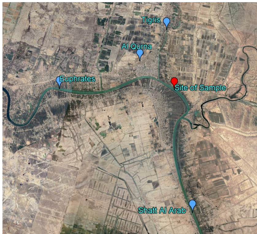
Fig. 1. Site of sample collection

To assess the DNA damage, Oxiselect comet assay kit (Cell Biolabs, USA) was used. The procedure was performed depending on the instructions provided by the producer company. the principle involves mixing the cells sample (hemolymph in this study) with a low melting point agarose, which is then applied on an Oxiselect comet slide covered with regular point agarose. After that, the mixed cells were exposed to a lysis buffer to lyse the cells and remove proteins, cytoplasmic and nucleoplasmic constituents, RNA, and cellular membranes. Then, an alkaline solution was applied on the slides to denature and relax the DNA. Subsequently, slides were electrophoresed to distinguish between the intact DNA and the damaged DNA. Vista green DNA dye was used to stain the samples, which were then visualized under a microscope connected to an image analysis system. The damage in DNA was scored according to Duthie and Collins (1997) .