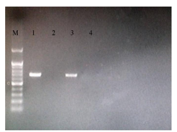
Figure 1: Agarose gel shows amplification of BCV partial sequence N gene amplicon size 700 bp,

associated with the partial BCV N gene amplification, was found in 6of 60samples tested as positive by RT-PCR (Figure 1).