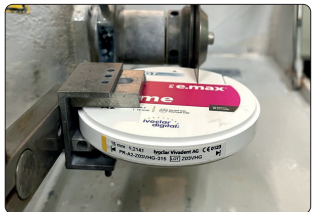
Fig. (2): IPS e.max ZirCAD prime being crafted using Isomet 4000 device