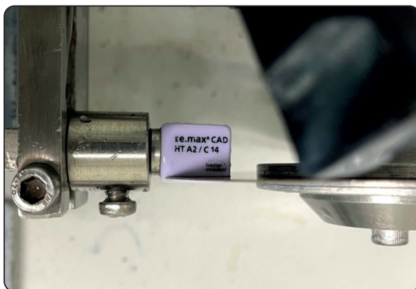
Fig. (1): IPS e.max CAD block being crafted using Isomet 4000 device