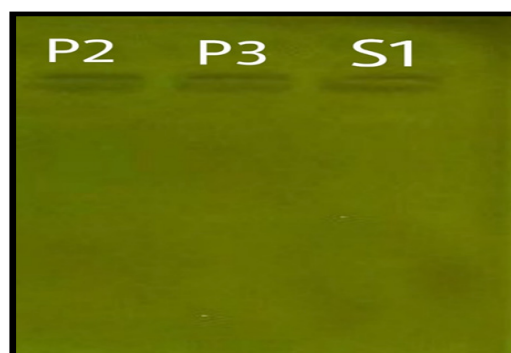
Fig. 2. Plasmid content of the studied bacterial isolates after treatment with (5-FU) on agarose gel at a concentration of 1.5% and a voltage difference of 80 volts for half an hour.