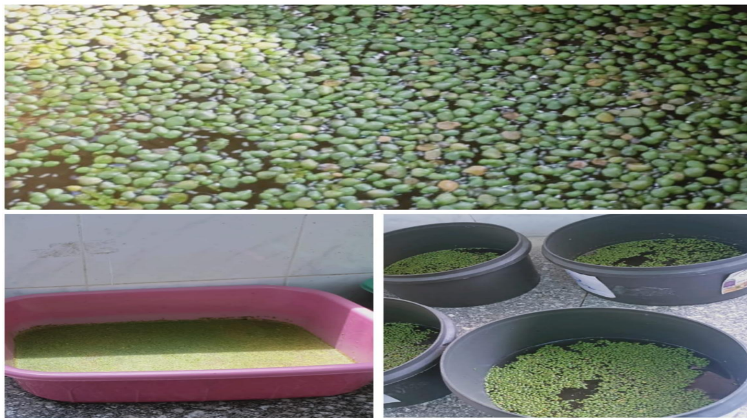
Fig. 1. Illustrates the appearance of the L. minor

Healthy L. minor plants were gathered in polythene containers and promptly transferred to the laboratory. To guarantee that no contaminants or pollutants remained, the plant samples were carefully cleaned with tap water followed by deionized water. L. minor plant was adapted to laboratory settings for 15 days in 30-L plastic containers filled with a half-strength Hoagland-nutrient Arnon's solution, with special care taken to choose plants of equal size and weight (Marin and Oron, 2007). The nutrient solution was changed 7 days later. This step was taken to promote their overall health and performance in the subsequent experiments.