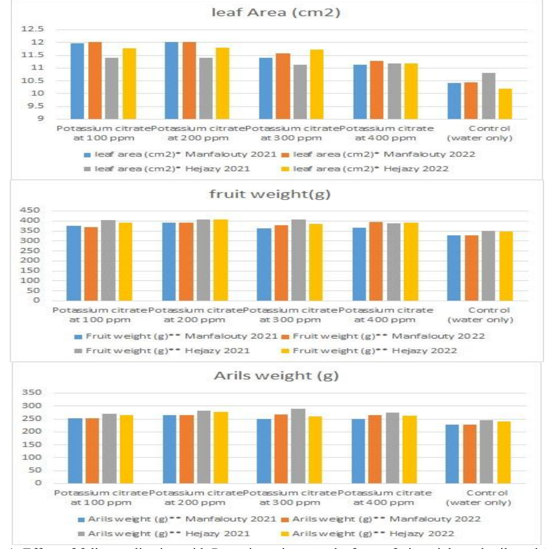
Fig. 1. Effect of foliar application with Potassium citrate on leaf area, fruit weight and arils weight of Manfalouty and Hejazy Pomegranate trees during 2021 and 2022 seasons.

** The values are means of Three replicates (3 samples/ each replicate).