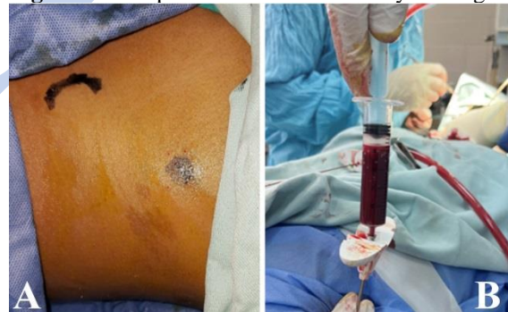
Figure 4 : (A) Examination of the donor site (B) Process of bone marrow harvesting