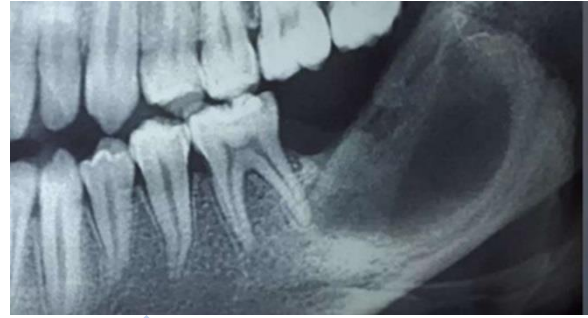
Figure 2: Preoperative radiographic examination