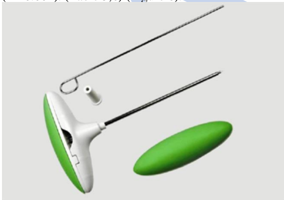
Figure 1: Jamshedji bone marrow aspiration needle for the collection of bone marrow.

Defect's bone volume calculation was done to allow for estimation of the bone formed quantity. the reduction in defect's bone volume across the follow-up period was statistically significant ( P <0.0001 ) for group I and ( P= 0.015 ). The calculated volume reduction percent in the three months scan from the immediate one was 51.38\% for group I and 30.96\% for group II. The volume reduction difference in the first three months between the two groups was statistically insignificant ( P= 0.529 ). The bone volume reduction percent in the six months scan from the immediate one was 84.17\% for group I and 42.95\% for group II. The volume reduction difference between the two groups was statistically significant ( P= 0.002 ). (Table 5,6) (Figure 6).