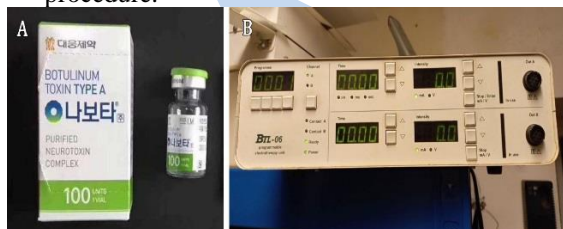
Figure (1): Photos showing: Materials and Devices, (A) Botulinum toxin type A, (B) Iontophoresis device.