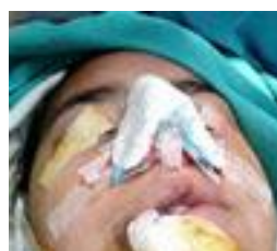
Fig. (14): Internal nasal splint

External nasal splint: We used Steri strep for fixation of graft and preventing hematoma and internal nasal splint using Vaseline gauze and external nasal splint using metal or cast splint (Fig. 15).