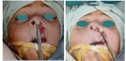
Fig. (3): MAC COMB dissection

Closed rhinoplasty: Closed complete release was done for ipsilateral hypoplastic LLC through lip incision during lip repair with release of malinsertion of orbicularis muscle ( Fig.3 )