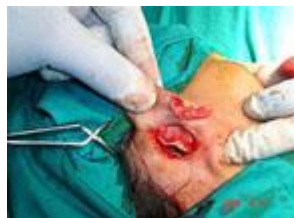
Fig. (9): Harvesting of auricular cartilage