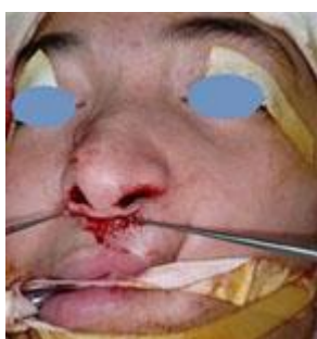
Fig. (10): Lengthening by bipediced nasal floor flap