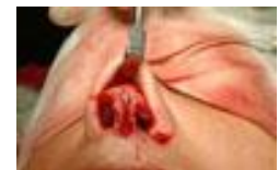
Fig. (6): LLC augmentation.