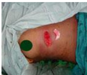
Fig. (8): Harvesting of costal cartilage

The goal of these instruments is to provide a starting point for individual facial plastic surgeons to evaluate the outcomes of these common procedures in a quantitative fashion. This will allow further assessment of patient satisfaction as well as provide the means by which new or innovative procedures can be compared with more traditional approaches. Scoring of each of these instruments is straightforward and designed to allow the surgeon to easily compare pre- and postoperative measurements. Each of the six items is scored on a 0–4 scale, with 0 representing the most negative response and 4 representing the most positive response. Dividing the total score for each instrument by 24 and multiplying by 100 yields the scaled instrument score. This range is 0–100, with 0 representing the least patient satisfaction and 100 representing the most patient satisfaction (8) (Fig.16).