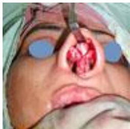
Fig. (7): Onlay graft