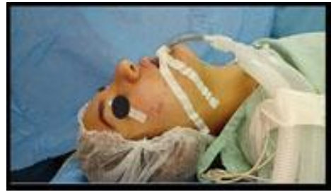
Fig. (2): Patient position (slight extended neck)

Positioning: The patient was placed in the supine position with the neck slightly extended using a small shoulder roll. The operating table is tilted into a slight reverse Trendelenburg position ( Under anesthesiologist’s supervision ) ( Fig.2 )