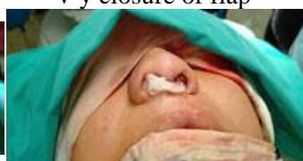
Fig. (13): Nasal back