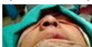
Fig. (12): Skin closure