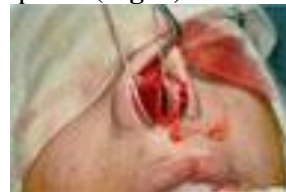
Fig. (4): Exposure of septum

Septal cartilage harvesting: We preferred to harvesting it by open approach because of the improved visualization. Firstly Separation of suspensory ligament between medial crura, then perichondrium was incised posterior to the anterior septal angle to expose the underlying cartilage. Bilateral submucoperichondrial tunnels were dissected deep to the upper lateral cartilages and a scalpel was used to separate the upper lateral cartilages from the dorsal septum. ( Fig. 4 )