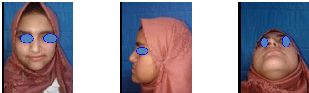
Fig. (21): Frontal, lateral and basal preoperative views