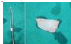
Fig. (5): Quadrangular septum harvested by knife

The submucoperichondrial dissection was continued bilaterally to release the entire quadrangular cartilage, then harvesting was done (septal blade was preferred) with adequate L-strut must be preserved ( Fig. 5-7 ).