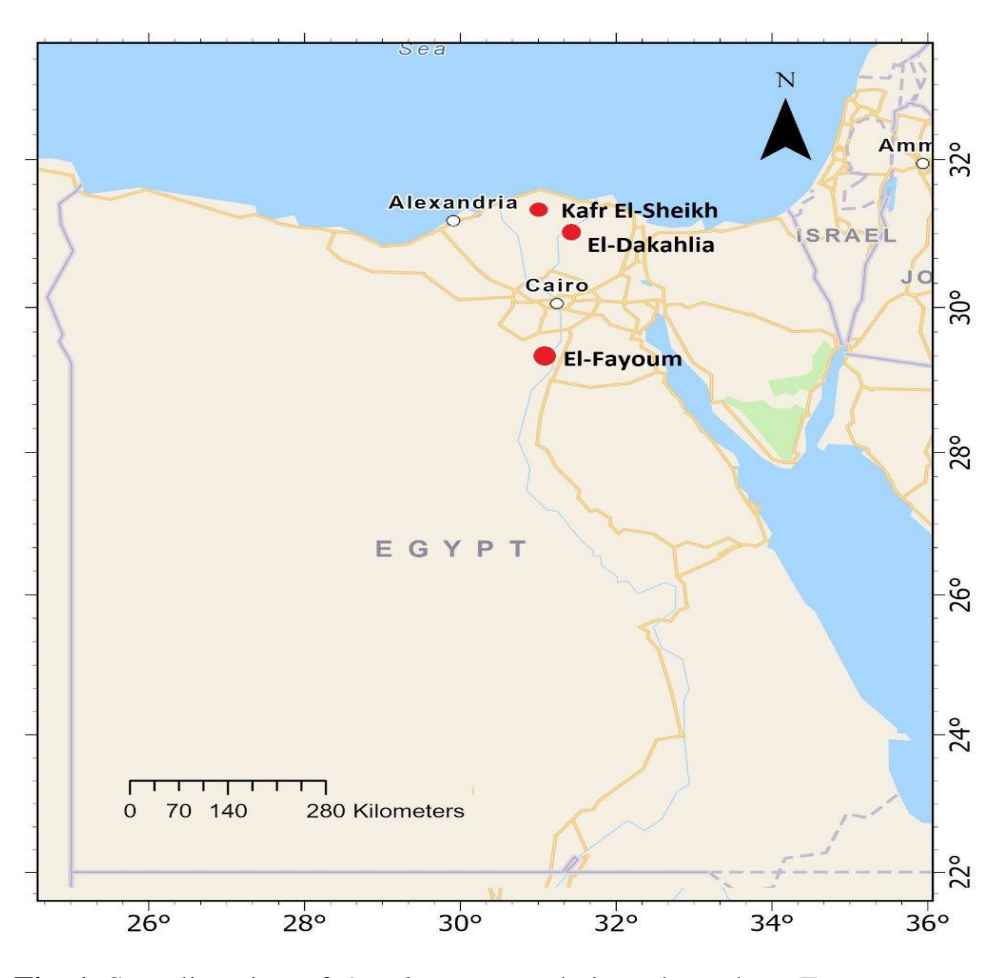
Fig. 1. Sampling sites of O. niloticus populations throughout Egypt