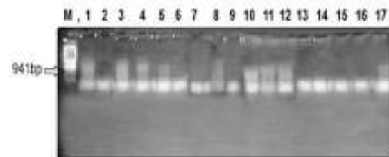
Figure 1. PCR for specific gene HsIPro-1 which indicate 941 bp, for genotypes from 1-17.

HsI pro-1 gene, which was isolated from the wild species of sugar beet ( Beta procumbens ) has been proven to confer resistance to beet cyst nematode (Cagle et al 2014).in this work the gene cleared resistant to root knot nematode spices ( Meloidogyne incognita ).