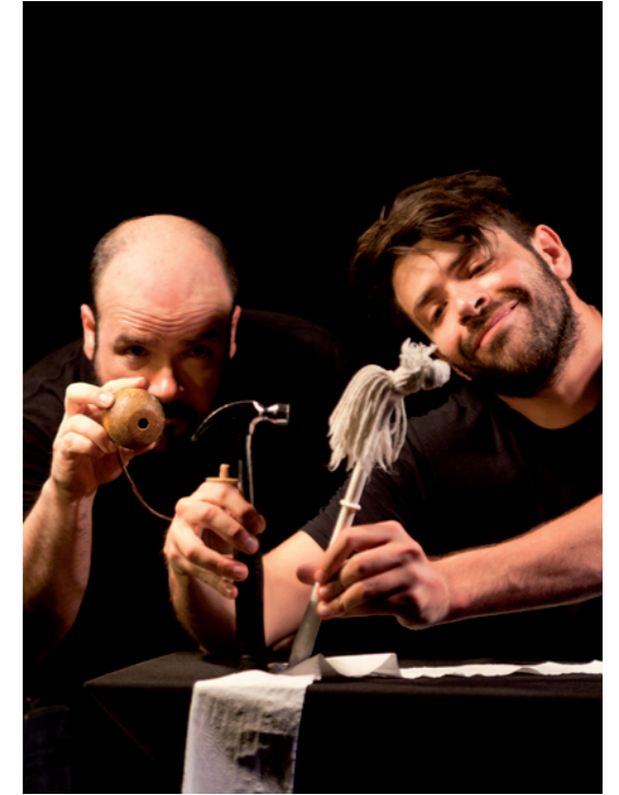
An Object Theatre performance, presented by Theatre de la Pire Espece: "Ubu on the Table", an adaptation of King Ubu. (9)

The scholar has attended two workshops in WSD in Cardiff (*) the instructors offered her different kinds of objects. She had to choose one or more and transform them into a char-