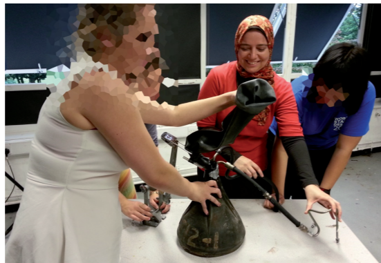
The Performing Object workshop, by Sean Myatt, as seen in the photo, objects on the floor, waiting to be transformed into a live puppet character.