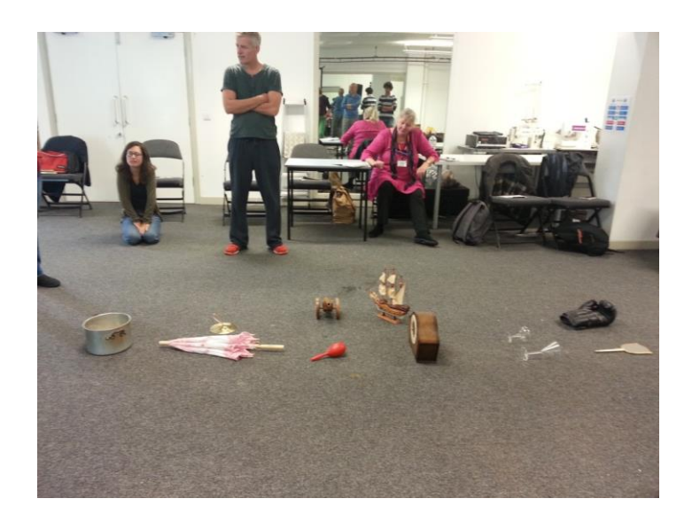
Figure 1 / The Performing Object workshop, by Sean Myatt, as seen in the photo, objects on the floor, waiting to be transformed into a live puppet character.

could figure out how to loosen her mind and body and she could move the object and make sounds transforming it into the character she wanted. After she finished and put the object on the floor, she still could feel it breathing, as if it is now lying there, resting for a while. She was still connected to it.