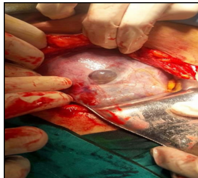
Fig. 4: Grade 4 is ruptured scar describing a connection between uterine and abdominal cavity is not showing was taken in intraoperative field - Kasr Al Ainy Hospital