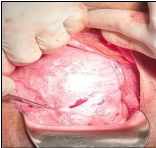
Fig. 5: Grade 2 is a thin uterine scar, but no uterine contents are visible was taken in intraoperative field - Kasr Al Ainy Hospital