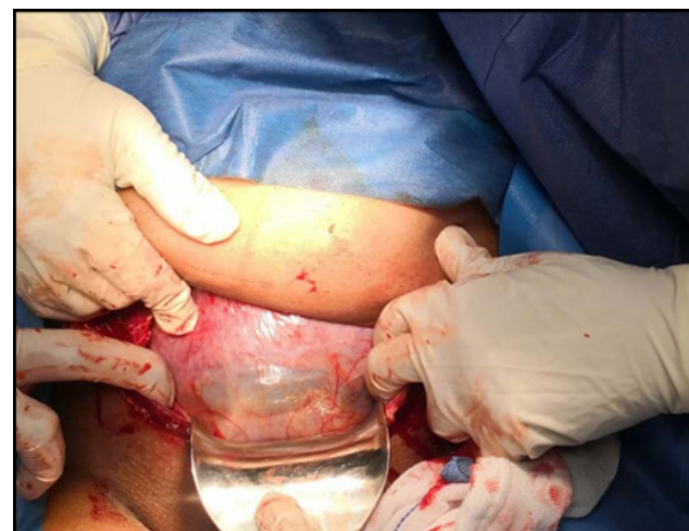
Fig. 3: Grade 3 is scar dehiscence/uterine content visible was taken in intraoperative field - Kasr Al Ainy Hospital