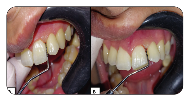
Fig. (6) (A) Chlorhexidine gluconate gel group at zero day (B) Chlorhexidine gluconate gel group 6 months follow up