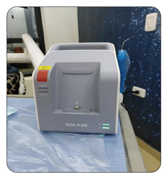
Fig. (2) Diode Laser Used in PDT

2. Light Activation: A diode laser matching the absorption spectrum of TBO was employed to activate the photosensitizer. The laser settings, such as power, exposure time, and mode, adhered to the recommended parameters for dental applications. Treatment was administered using a fiber optic tip inserted into the periodontal pockets (Fig.2).