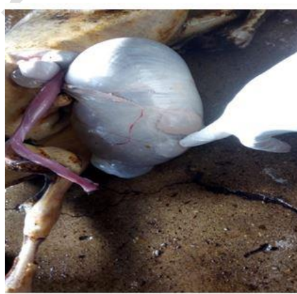
Fig. 2: C. tenuicollis in omentum of goat