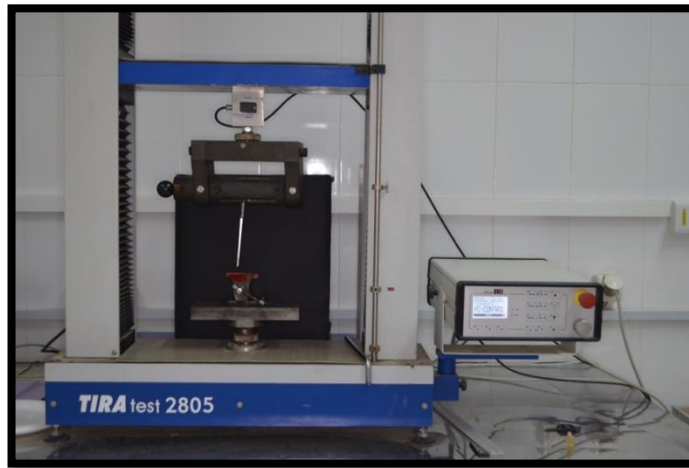
Figure (3): TIRA test 2805 shear bond testing machine