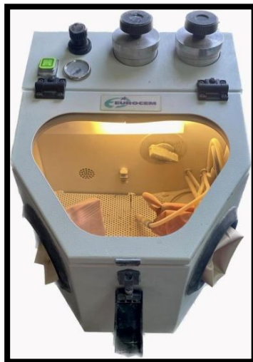
Figure (2): Eurocem sandblasting machine

sandblasting handpiece. Each bracket was sandblasted for 40 s until resin composite was completely removed from the fifteen brackets [8].