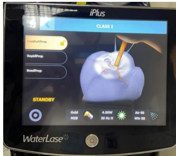
Figure (1): Er,Cr:YSGG laser (Waterlase, Iplus, Biolase technology, CA, USA)

(Figure 1). Tip used was 800 \mu\text{m} in diameter removed from the fifteen brackets [8]. (MZ8) until resin composite was completely