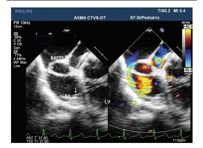
Transesophageal view at mid-esophageal level at 0 degree, probe rotated right side with colour compare showing turbulence suggestive of pulmonary venous baffle stenosis. RA: Right atrium; LV: Left ventricle.

Senning's procedure. The obstruction in PVBO occurs commonly between the inferior vena caval baffle-limb and the lateral atrial wall [1].