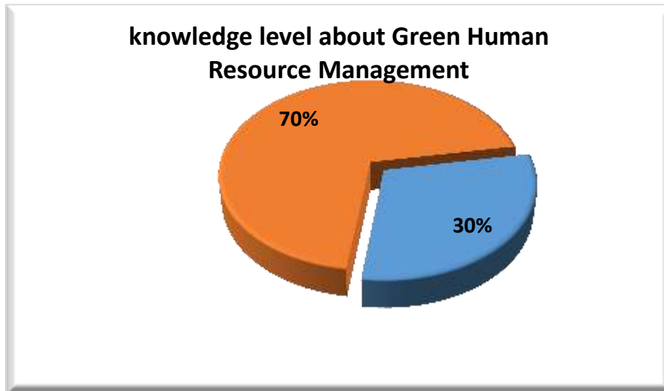
Figure (1): Percentage distribution of nurse managers' level of knowledge about green human resources management (N=50).

Table (1): Shows that more than half (58%) of the study subject age was ranged between (30-35) with total Mean \pm SD (31.6 \pm 3.2). As regard years of experience half (50%) of them were less than 10 years. Also about two thirds (66%) of them were males and more than half (54%) of them were bachelor degree in nursing. In addition only (6%) of them were working at outpatient department, more than a quarter (28%) were at inpatient department and less than half (46%) were working in other departments.