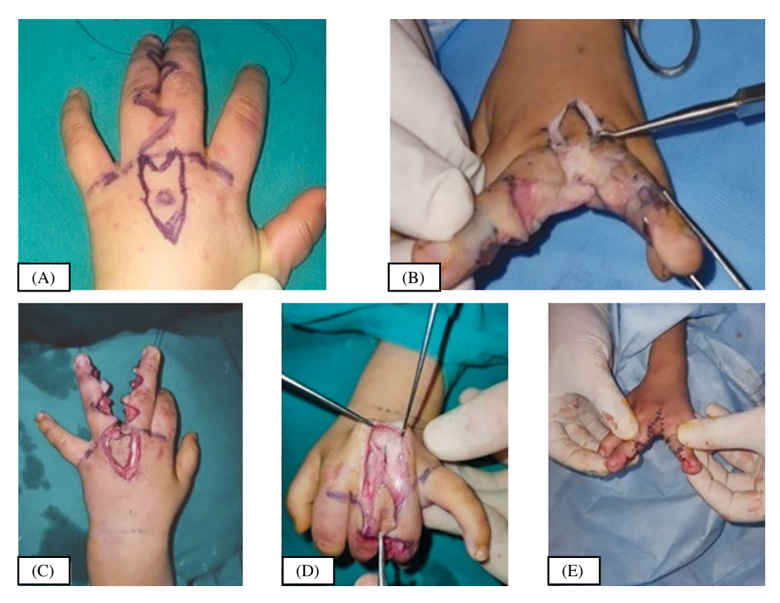
Fig. (1): (A) Preoperative identification of DMAP and marking of DMAP flap (B) Finger separation by Skoog's zigzag incision (C) The DMAP flap was created based on the dorsal metacarpal artery perforator situated between 0.5 and 1cm from the MCP joint proximally. The flap was designed with a triangular tip at the proximal end and a distal concave edge. (D) Flap elevation and DMAP identification. (E) Flap inset and new web formation.

Statistical analysis was performed using the Statistical Package for the Social Sciences software version 22 (IBM SPSS Inc., Chicago, IL) for Windows 10. Categorial variables were expressed as percentages and continuous variables were expressed as means \pm SDs (range).