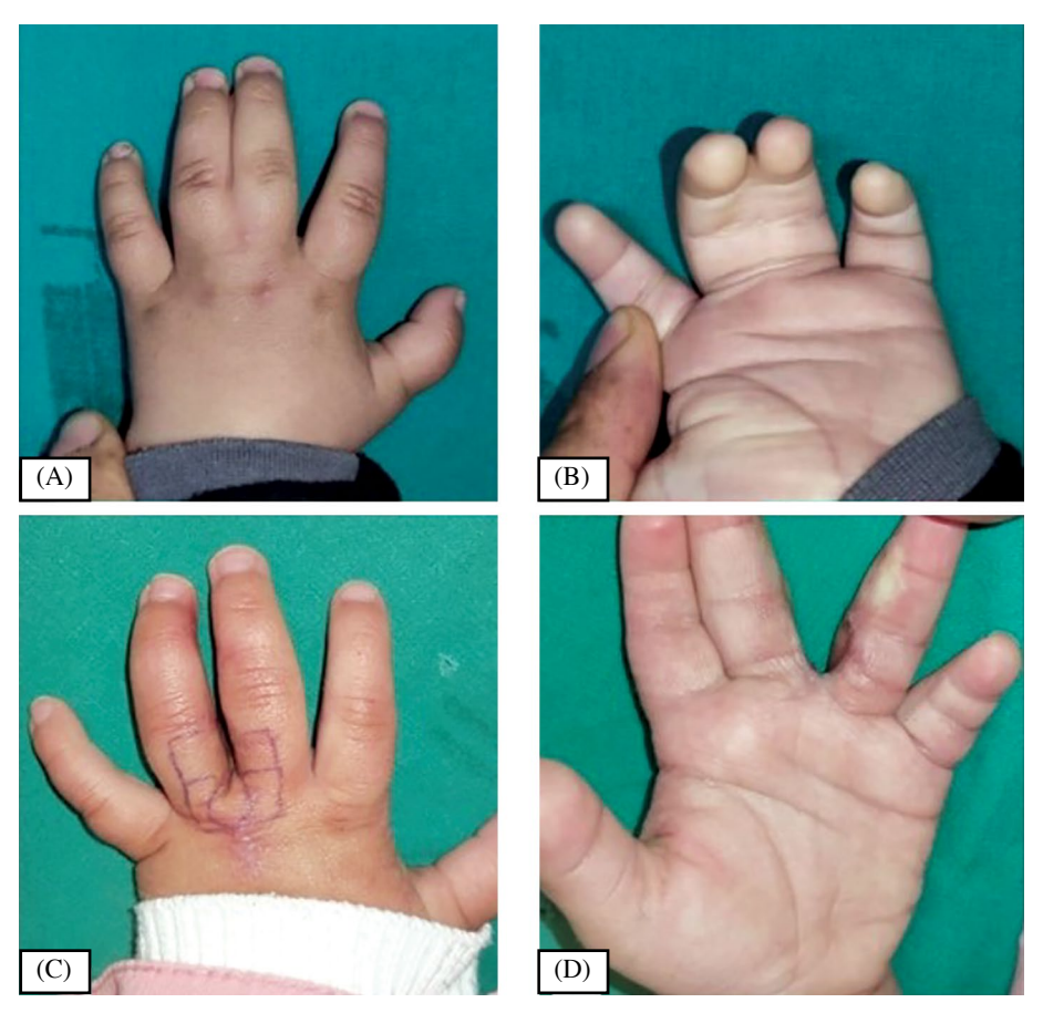
Fig. (3): An example of a Case: 1.5-year-old male patient with incomplete simple syndactyly ( ) the left middle and ring fingers. (A) pre-operative dorsal view (B) pre-operative ventral view (C) 1-year post-operative dorsal view (D) 1-year post-operative ventral view.