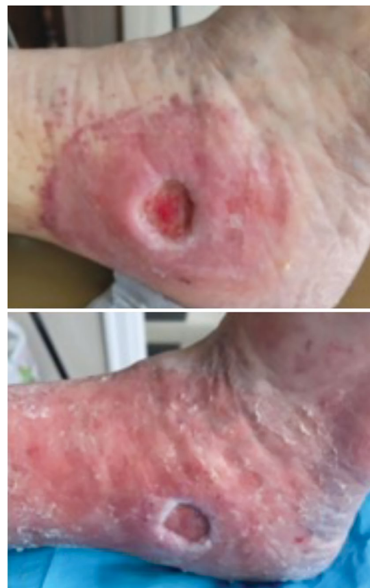
Fig. (3): A case of 57-year-old female patient, with an ischemic ulcer over the lateral aspect of right foot before intervention (top), and at day 5 of using LGF.