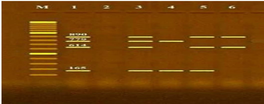
Fig (1): Agarose gel electrophoresis of multiplex PCR of Stx1 (614 bp), stx2 (779 bp), eaeA (890 bp) and hlyA (165 bp) genes for characterization of E. coli .

Lane M: 100 bp ladder as molecular size DNA marker.