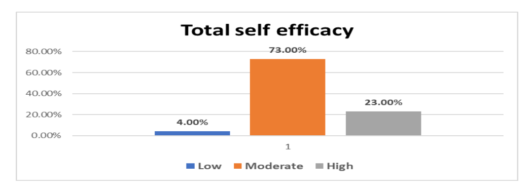
Figure (2): Total self-efficacy among the study patients (N= 200).

Figure (1): shows that 86.0 % of the study patients have fair self-care behavior, 8 % have good self-care behavior and 6 % have poor self-care behavior.