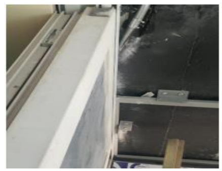
Fig.8: Installing Jebsen board on the aluminum units of the skinned on its units

4-There were scratches on building skin column cladding units cause of the Jebsen boards scaffolding. The worker didn't care about the cladding column and there weren't enough coordinator about the skin works which lead to re cladding this column. Fig. 11,12, 13