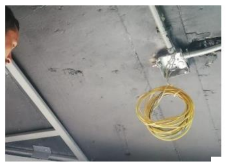
Fig. 14: broken at the ceiling at the skin side