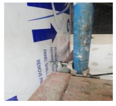
Fig.13: scratches on building skin column cladding units