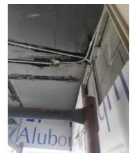
Fig. 15: broken at the ceiling at the skin side