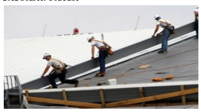
4. 7 Fig. 3 (A): Safe construction at building envelope. Source: https://smartenergy.illinois.edu/