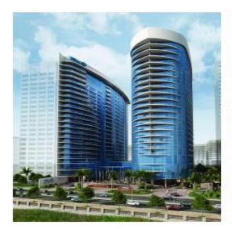
Fig. 5: Hotel towers in Cairo Maadi

2-There were water spots on building skin cladding cause of the consultant did not match the drawing with the reality and didn't take with the notes of the designer to make the owner satisfaction with neglecting this result. Fig. 9