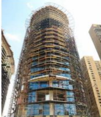
Fig. 6: Hotel towers in Cairo Maadi under construction