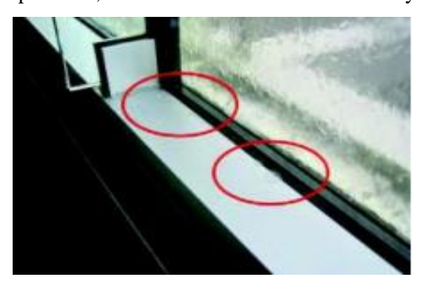
Fig. 4 (A): (Installation issues)Water ingress observed during laboratory static water penetration resistance testing.

For this reason, the cladding sequence should be shown on the appropriate contract drawings and any changes should be discussed with the structural engineer, so that the structural implications may be assessed. The cladding installation sequence may also be important in terms of forming the laps between the sheets and obtaining airtight joints at interfaces. Where the cladding manufacturers provide specific recommendations for the installation of their products, these should be followed carefully.