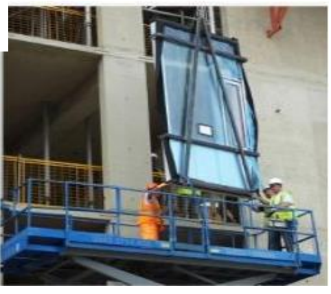
\begin{tabular}{ll} Fig. 3 (B): Safe construction at building envelope. \\ Source: $\underline{www.seniorarchitectural.co.uk}$ \\ \end{tabular}