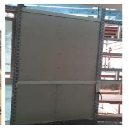
Fig.7: Installing Jebsen board on the aluminum units of the skin not on its units Source:

3-Cutting and scratch on the glass protector cause of the lack commitment of the Schedule time for construction project. This late was from the owner so it has to hiring another company to repaired the defects which lead to waste in (time, money) Fig. 10.