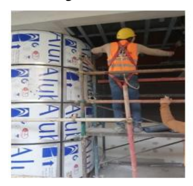
Fig. 11: scratches on building skin column cladding units