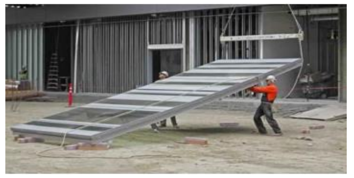
Fig. 2 (A): (UP) Curtain wall installation complete at Hyundai Motors

• Sealants at the skin tend to be overlooked because there is no clear identification as to whose package they are in