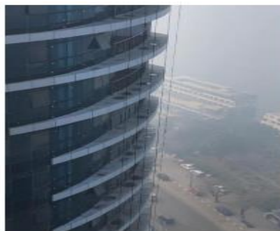
Fig.9: Water spots on building's cladding