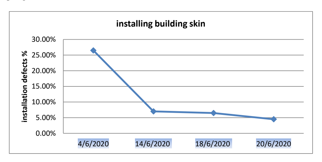
Fig.17: Control Chart of the defect percentage during building skin installation in several days.

-This stage is responsible for maintaining consistent successful performance and continuous improvement which involved project management team for an unending top to bottom [26]. The following control chart illustrate the controlled processes that required specialized personnel to conduct quality assessment and benchmarking. These charts contain 4 phases of skin installation in the site on these dates (4/6/2020 - 14/6/2020 - 18/6/2020 20/6/2020) with de-coupling skin erection from other trades.