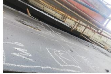
Fig.16: m Extra part in concrete must be removed

From the previous observations the researcher proposed a framework to avoid the defects and problems during building skin installation by knowing its processes and activities and consider them whether main or sub processes.