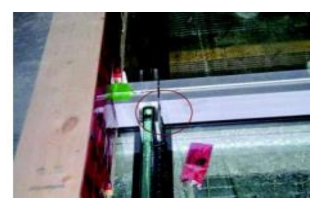
Fig. 4 (B): (Installation issues)Unexpected water ingress at a butt joint in the horizontal mullion during the test chamber Source: [1]