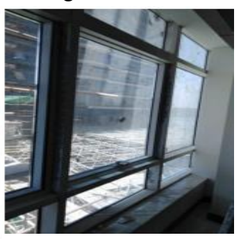
Fig.10: cutting and scratch in the glass protector