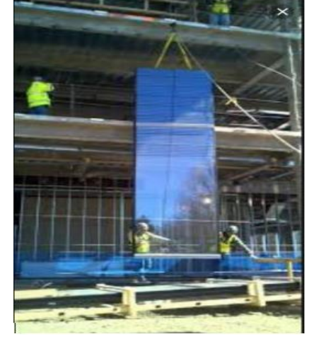
Fig. 2 (B): (left) Curtain wall installation at the Yale school 2012