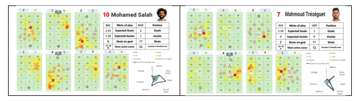
Figure (4) Individual analysis of the most participating players in creating scoring opportunities for the Egyptian national team in the tournament

The above emphasizes the importance of relying on modern technologies and the science of data analysis in football, because of its great importance in identifying the strengths and shortcomings in the performance of the player or team, and gives an immediate and accurate indication about the progress of the match, and the extent to which it is close to