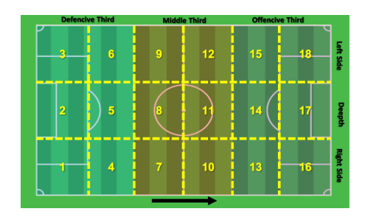
Figure (1) Dividing the stadium into 18 zones including defense, midfield and attack areas as well as depth and periphery areas

The results showed that there is no statistically significant correlation between the zones of high activity of the players and the zones of creating scoring opportunities, as the activity of the highest players was concentrated in the defensive third and then the middle third, which explains why the Egyptian goal received only two goals throughout the tournament, while it is clear that the offensive third was the least active by the Egyptian national team players during the tournament matches, so the offensive third zones were the least active throughout all matches, while the most areas that were created scoring opportunities This is one of the strongest reasons for the low scoring rate of the Egyptian national team, as the zones of high activity of players during matches differ from the zones where scoring opportunities are created.