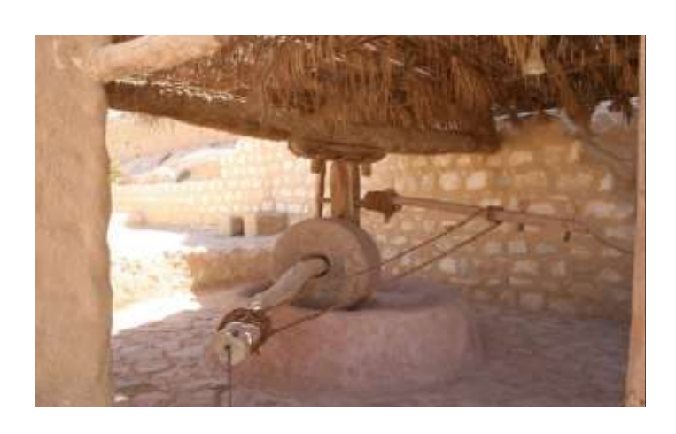
One of the millhouses of the Monastery of Saint Anthony the Great in the Red Sea. SHERIN SADEK EL GENDI (2010)