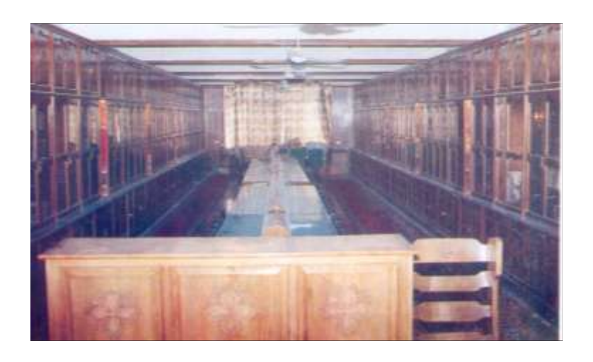
Inside the library of the monastery of Saint Pishoi in Wadi Natrun. SHERIN SADEK EL GENDI (2010)