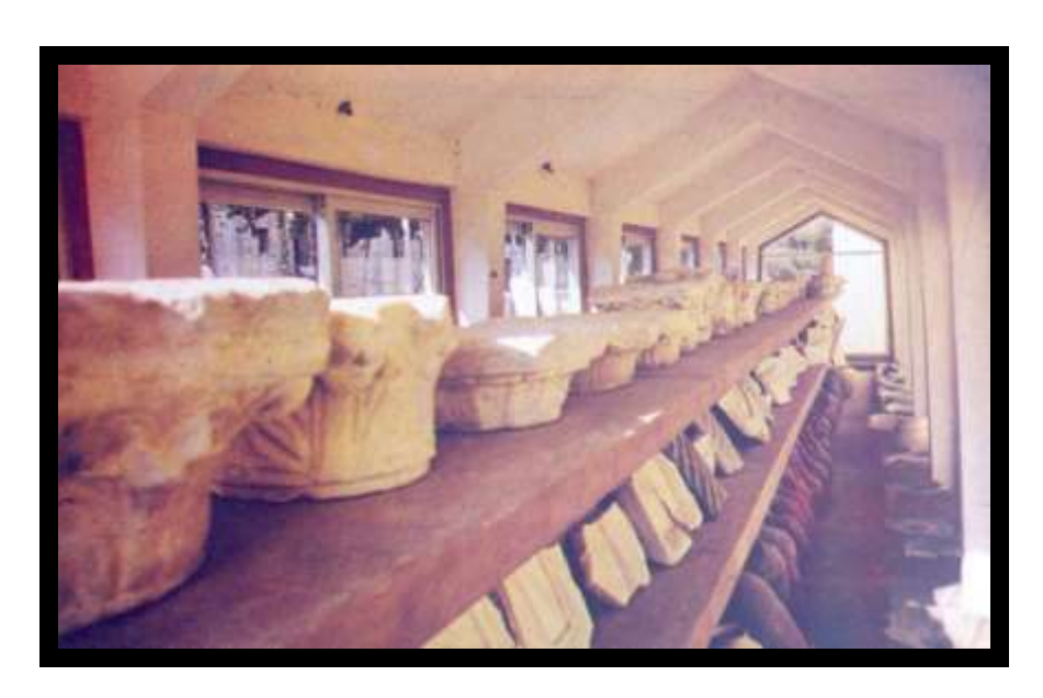
The Museum of the monastery of Saint Macarius the Great in Wadi Natrun. Sherin Sadek El Gendi (2010)