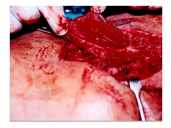
Fig.(2): The sartorius muscle, lateral border is twisted medially to cover the femoral vessels.