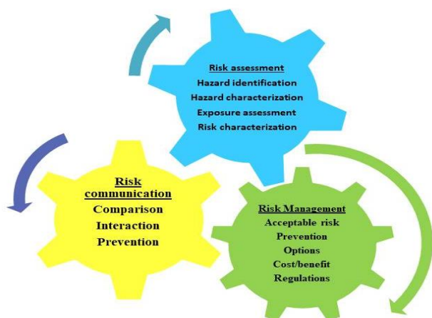
Fig. 2 – Framework of food hazard assessment.

(FAO/WHO 2016) stated a frame work for food hazard assessment that has been adopted by many national and regional food safety authorities around the world. The frame work is conducted through three main factors that work all together, risk assessment which defined as the process that is used to quantitatively or qualitatively estimate and characterize risk, risk management is the weighing and selecting of options and implementing controls as appropriate to assure an appropriate level of protection, and risk communication is defined as the exchange of information and opinions between people, specifically about risk and risk-related factors associated with food safety hazards (Fig. 2).