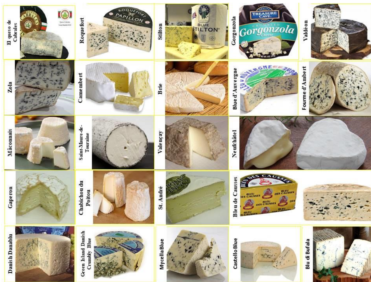
Fig 1 - Types of fungi ripened cheeses manufactured worldwide.