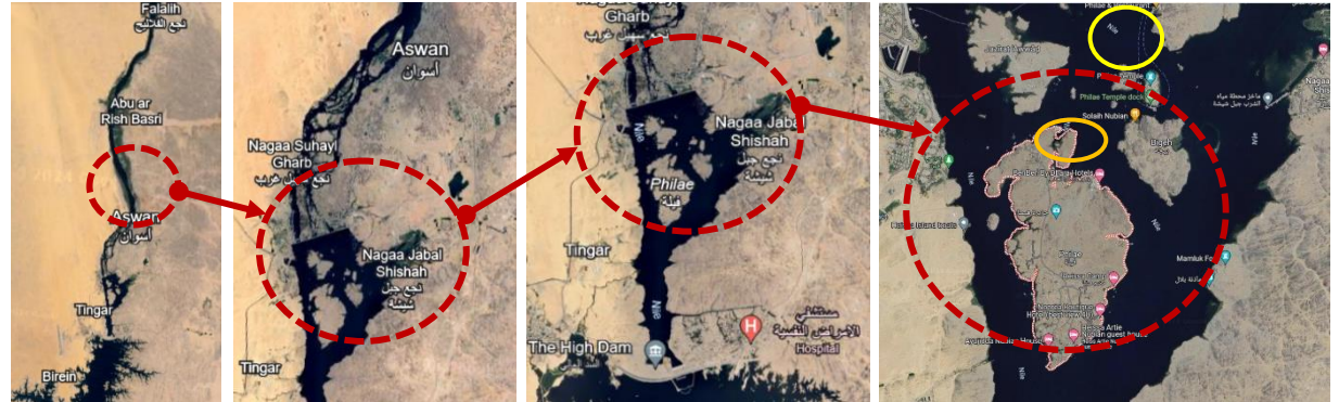
Fig. 1. Philae Temple Location [33]

The research was conducted in Aswan, an old and historical tourism destination in Egypt. on the old Nubian Island of Hiessa, Aswan, Egypt located in front of Philae temple [30]. The Philae Temple is a magnificent example of ancient Egyptian architecture and mythology [31]. Philae Temple offers invaluable insights into the religious practices, social structures, and dynastic histories of ancient Egypt [32]. (Fig. 1) shows the location of the Philae Temple and its relation to the case study location.