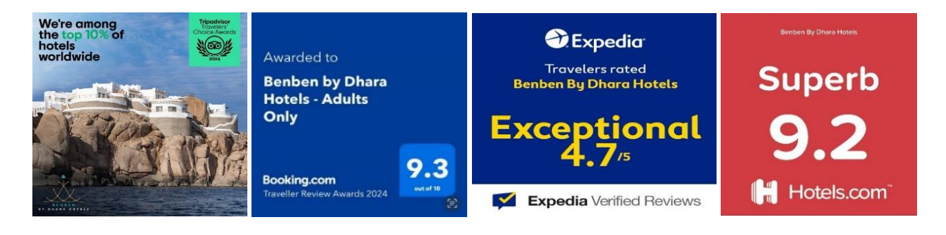
Fig. 2. Benben by Dhara Hotels awards 2024 [10]

The selection of the case study is based on being one of the hotels that serves as a beacon for heritage architecture enthusiasts, distinguishing itself from other renowned establishments in the vicinity. Embracing its identity as a heritage architecture hotel, it has garnered recognition on a global scale, being honored as one of the top ten hotels worldwide by Dhara Hotels. This accolade is further substantiated by specific certifications awarded to the hotel, affirming its commitment to excellence in hospitality and preservation of architectural heritage. Following the successful completion of the hotel project, progress is now underway on the second phase of development. This advancement stands as a testament to efficiency and achievement. (Fig. 2) shows hotel awards 2024.