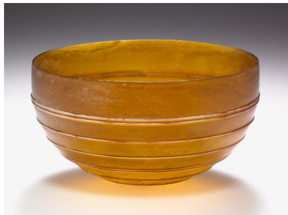
Figure (3): Amber Bowl with White Ridges , Roman, 1–100 C.E., cast glass 4-1/16 inches in diameter (The J. Paul Getty Museum, 2003.475).

Casting is a technique of pouring hot glass into a mold. After the glass cools, glassmakers use various grinding and cutting techniques to refine the vessel's form and decoration. Any of several glassmaking techniques involving the use of single (open), multipart (closed), or former molds.