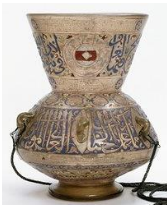
Figure(5): mosque lamp ,mamluk period ,V&A Museum

in the 14th century, when Egypt and Syria were ruled by the Mamluk sultans, the glassmakers of the region produced large and magnificent lamps with enameled and gilded decoration, often including bold inscriptions in Arabic. In this example the text in blue in the upper band comes from the Qur'an, while the text in white below names the donor. He was Aqbugha, a high official at the court of the Mamluk sultan al-Malik al-Nassir Muhammad during his long third reign (1310–1340).