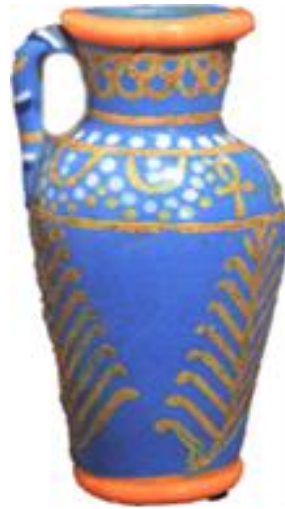
Figure (1): one of the earliest Egyptian glass vessels about 1425 B.C, height 8.7 cm., British museum, Uk.

This jar is one of the earliest Egyptian glass vessels to have been found. The few glass beads of the Old Kingdom (about 2613-2160 BC), made a thousand years earlier, The Egyptians began producing glass in quantity in the New Kingdom (1550-1070 BC). The technique was perhaps brought to Egypt by Syrian craftsmen, as its introduction seems to coincide with the successful Syrian campaigns of Thutmose III. Glass was produced by heating quartz sand and natron until they were molten, adding a color agent such as a copper compound for blue and green. To make a glass vessel, a core of sandy clay was molded over the end of a metal rod to form the interior shape. The rod was dipped into the molten glass and spun to coat the core. The craftsman added details such as handles and bases using tongs, while the glass was still hot. The color of this vessel probably imitates turquoise, the yellow and white represents gold and silver. The tamarisk trees, dots and scales, and the name of the king are enameled, the earliest known example of this technique in Egypt.