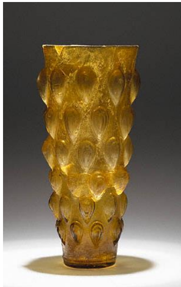
Figure (4) Lotus Bud Beaker , Roman, Eastern Mediterranean, 1st century C.E., mold-blown glass, 8-3/8 inches (The J. Paul Getty Museum, 2003.320).

form popular in the mid- to late first century A.D. and well represented among the finds at archaeological sites in Italy and elsewhere in the Roman world is the so-called lotus beaker. The name of this type of vessel derives from the relief decoration of protruding knobs, commonly identified as a lotus bud motif. Five rows of knobs protrude from the body of this fairly small example, with raised circular dots appearing in the spaces between the knobs. The size of the vessel, the absence of relief decoration toward the top of the body, and the slightly splayed rim may indicate an intended function as a drinking vessels Figure (4).