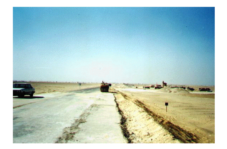
Fig.3 Stabilization of a sandy shoulder of an asphalt road after spreading of the upper surface layer containing BCD and during its compaction .