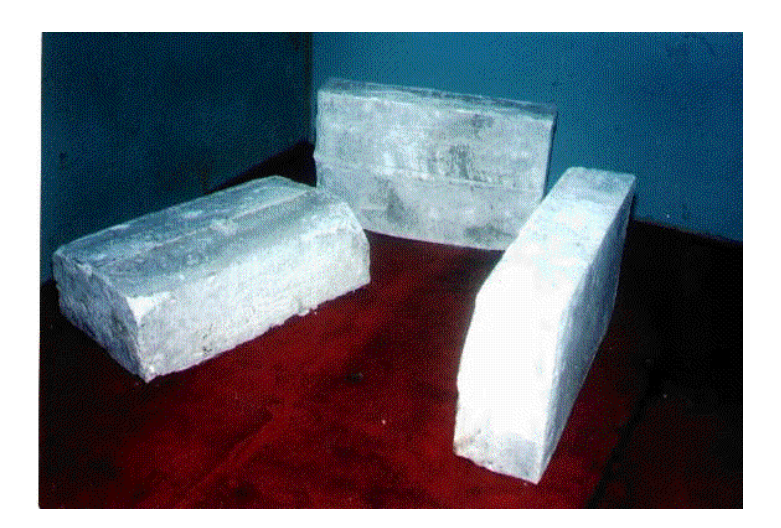
Fig.1. Curbstones made of by-pass cement dust at Factory 45 on semi-industrial scale with dimensions of 0.3 \times 0.2 \times 0.5 m.