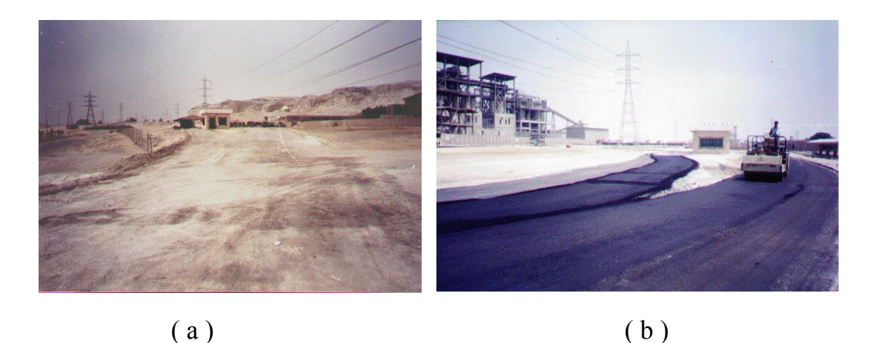
Fig.4 (a) The base layer made of BCD and iron slag after spreading and compaction, (b) The spreading of the upper layer above the binding layer at location of the balance area near by furnaces 8 and 9 at Tourah Portland Cement Co.

Fig.3 Stabilization of a sandy shoulder of an asphalt road after spreading of the upper surface layer containing BCD and during its compaction .