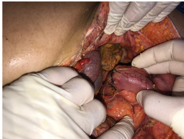
Fig. 2: Intraoperative image confirming primary repair of trauma in second part duodenum.