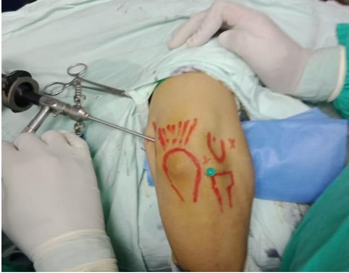
Figure (2): The proximal anteromedial portal (viewing portal) the lateral soft spot.

The back flow of fluid through the cannula confirms entry into the joint. The 4 mm, 30° arthroscope was inserted into the joint. The lateral capsule and radio capitellar articulation were easily inspected. The joint capsule was examined for thickening, scarring and inflammation. Then the proximal anterolateral portal (2 cm proximal and 1cm anterior to the lateral epicondyle) was identified (working portal).