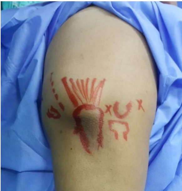
Figure (1): superficial skin landmarks.

All elbow arthroscopies were done in the lateral decubitus position. After the landmarks have been identified and marked on the skin, the limb was exsanguinated, and the tourniquet was inflated to 250 mmHg.