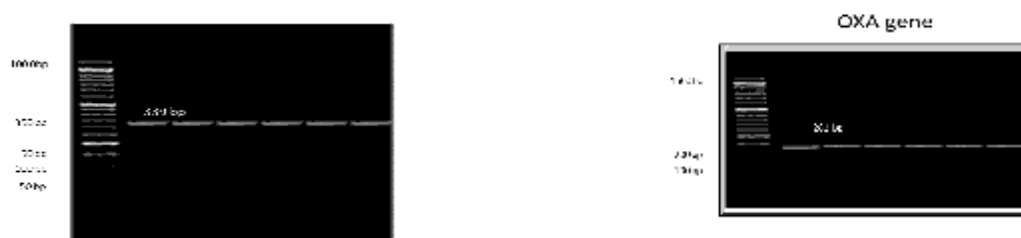
Figure 3: Agarose gel electrophoresis of blaNDM-1 gene (339 bp) Figure 4: Agarose gel electrophoresis of blaOXA-48 gene (281 bp)