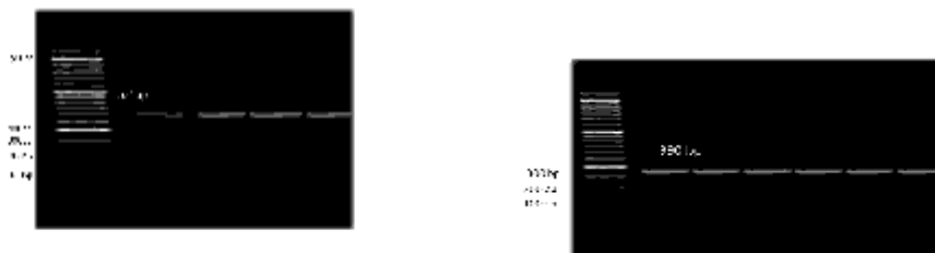
Figure 1: Agarose gel electrophoresis of amplified bla KPC gene (521 bp). Figure 2: Agarose gel electrophoresis of amplified bla VIM gene (390 bp).