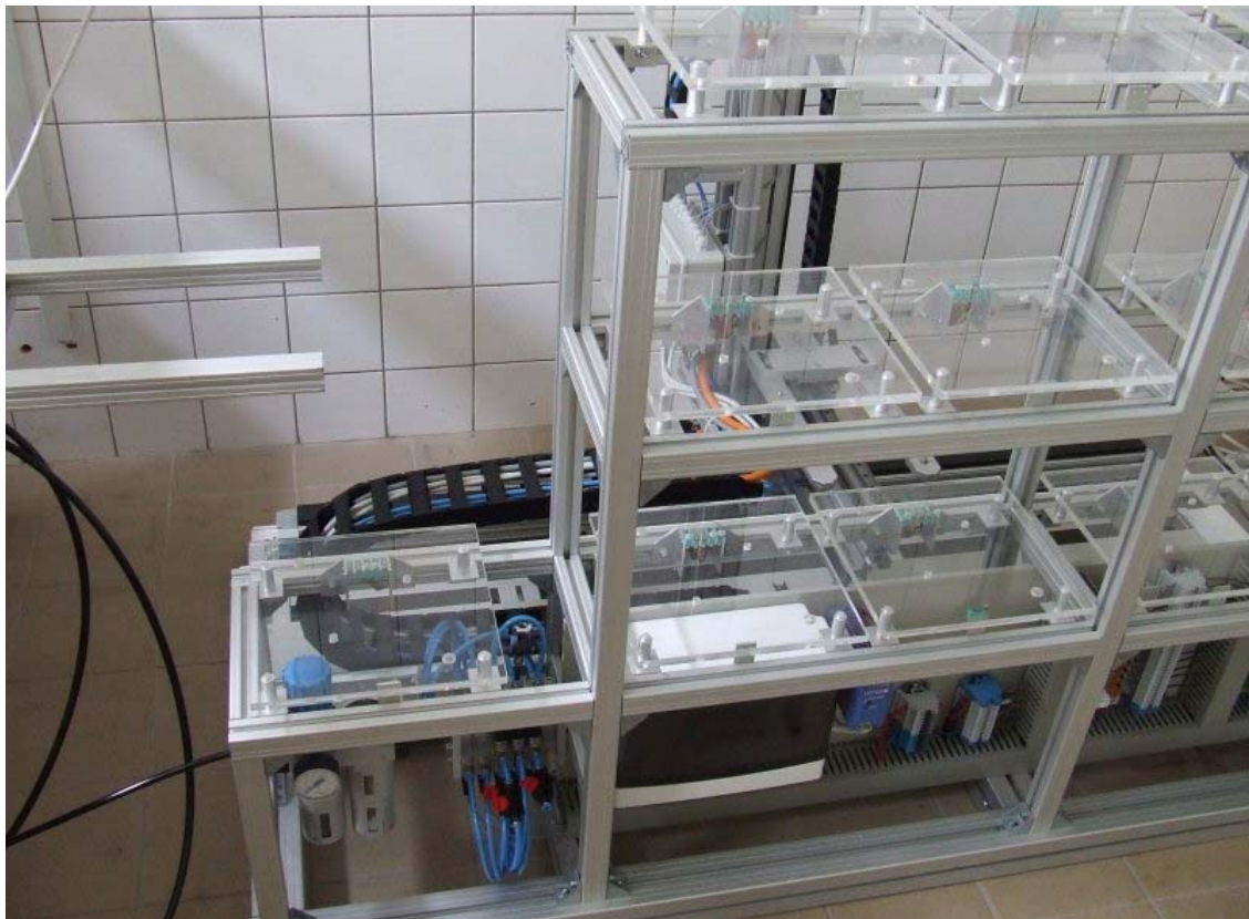
Fig. 3: Shelf storage system