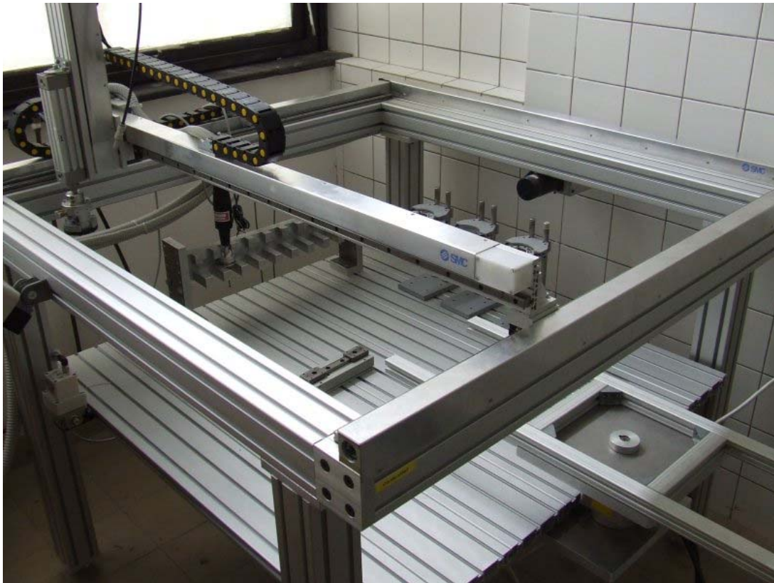
Fig. 1 Flexible manufacturing cell