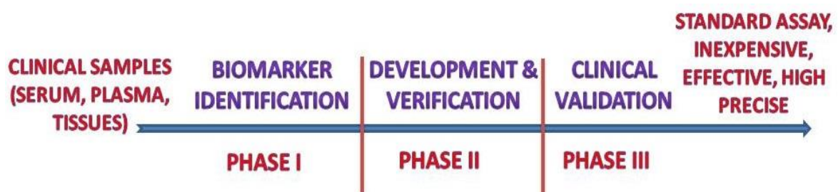
Fig (1): Pipeline showed phases of protein biomarker discovery

Protein marker identification has been performed in three different phases (Figure 1). Initially, the identified proteins are subjected to verification, development and finally clinically validated (Fig. 1) [16]. Protein biomarkers can be detected by several tools such as high- performance microarrays, radiological assays, 2-dimensional electrophoresis, mass spectrometry and western blot (Fig. 2) [17]. Cancer molecular study is basically depends on evaluating protein expression level and its related prognostic findings to help in taking clinical decision for tumor therapy [18]. Mostly in clinical diagnosis, protein biomarkers are used for over-expressed proteins assessments in clinical specimens which is performed by varied immunoassay approaches such as immunohistochemistry, enzyme-linked immunosorbent assay (ELISA), and so on [19].