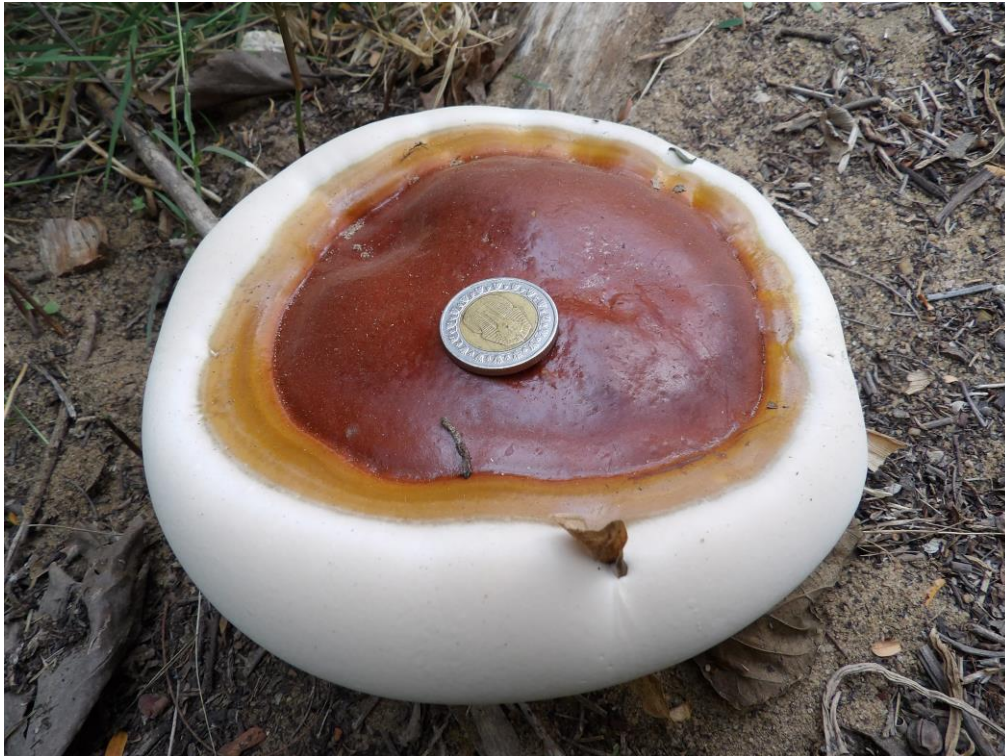
Fig 1 – Basidiomata of Ganoderma lucidum.

basidiospore (Donk 1964). In all, 219 species within the family have been assigned to the genus Ganoderma , of which G. lucidum is the species type (Moncalvo 2000). Basidiocarps of this genus have a laccate (shiny) surface that is associated with the presence of thick-walled pilocystidia embedded in an extracellular melanin matrix (Moncalvo 2000).