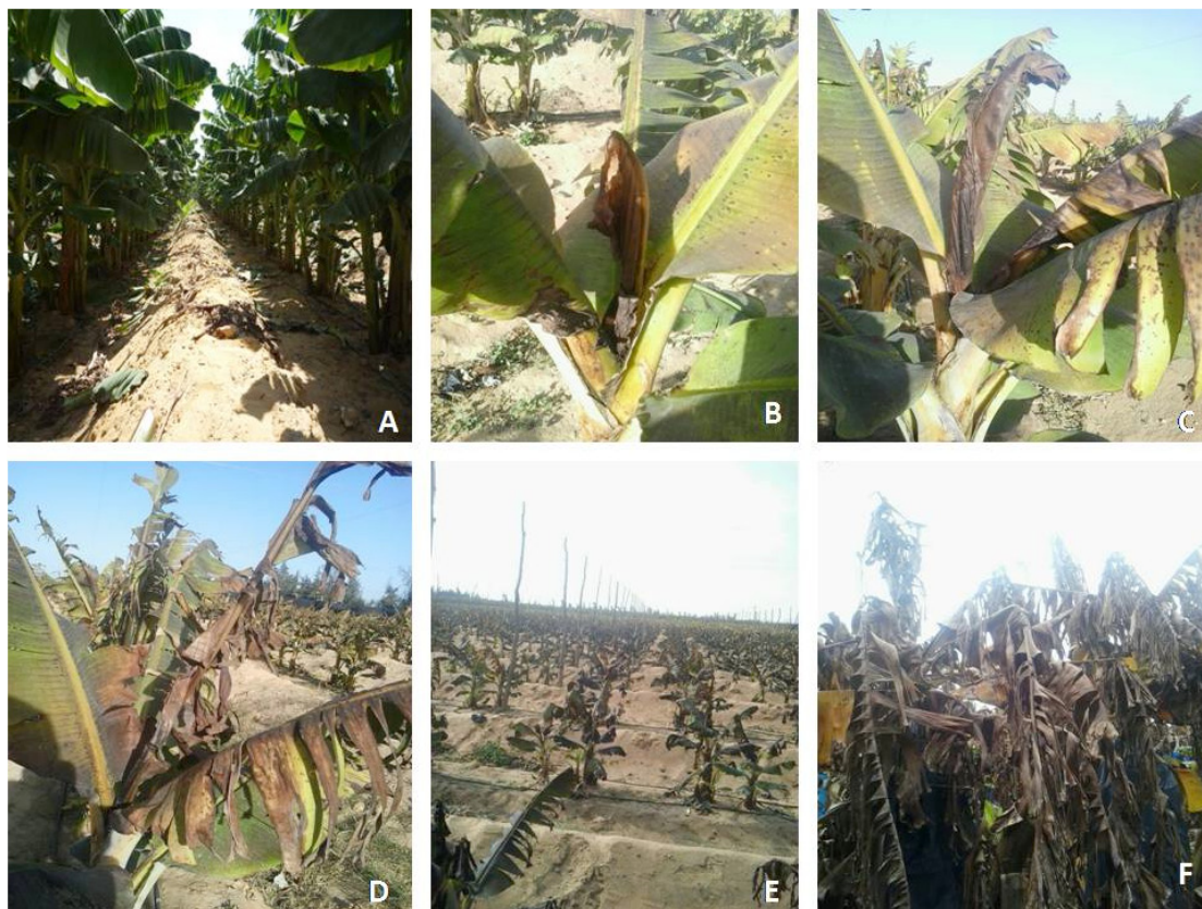
Fig. 2. Effect of low temperature ( 4 \pm 2 °C) on growth of banana plants during January (2017) in open field in El Nubaria (Beheira Governorate, Egypt), where (A) normal and healthy field, (B), (C) and (D) stages of cooling effect caused vegetative burn (E) open field of mother banana plants burned and (F) open field of the first generation of banana plants burned. This change in climate has been caused a loss by several million dollars this year in Egypt for the farmers of banana.

Therefore, the impact of climate changes on agriculture and food security should be addressed to the global level. The relationship between agriculture and climate change is complicated, where the agricultural practices impact and influence by climate changes. Nearly all agricultural production and practices depend on climatic elements and these practices could control the global change in climate. The adaptation and mitigation of the changes in climate should be faced by both developed and developing countries as well as there is no nation away from these climate changes all over the world.