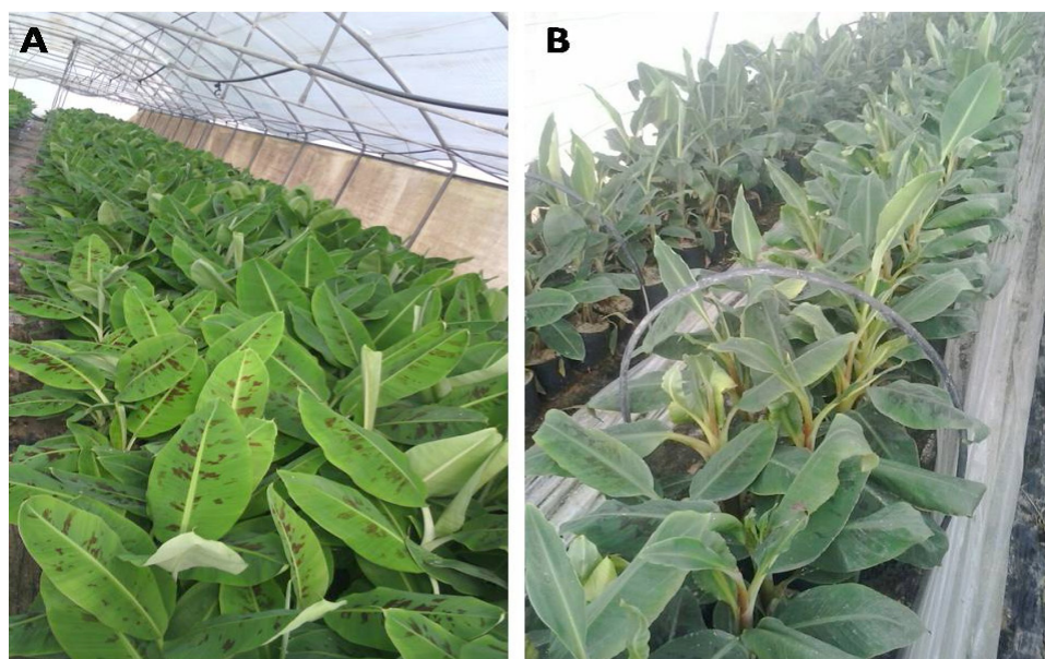
Fig. 1. Effect of low temperature ( 6 \pm 2 °C) on growth of banana seedlings during January (2017) in greenhouse in El Nubaria (Beheira Governorate, Egypt), where (A) normal growth and (B) abnormal plants with spear shaped leaves, narrow blade, needle edges and pale color (Photos by Elmahrouk).

From these previous publications, it is clear that climate change is penetrated all our life. Agriculture sector is considered the main source of global food and water security. This sector accounts for 24 % of greenhouse gas (GHG) emissions (carbon dioxide, methane, nitrous oxide). Therefore, the mitigation and adaptation to climate changes may be reconciled in climate-smart agriculture proposals in these previous two different responses (Torquebiau 2016). So, the European Union has a great challenge about the integration of agriculture into the frameworks and strategies of global climate change mitigation policy. This challenge includes (1) a reduction in GHG emissions, (2) a wide need for technological mitigation options, (3) the mitigation of climate change should be at national and global level and (4) the agriculture sector should contain multilateral commitments to limit emission leakage (Fellmann et al. 2017).