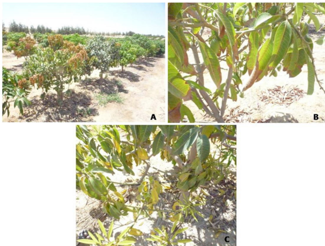
Fig. 4. Effect of soil alkalinity stress (pH: 8.9) and salinity of irrigation water (2500 ppm) on the growth of mango production in El-Khatatba (Minufiya Governorate, Egypt), where (A) normal plant, (B) burned the leave edges by soil salinity and (C) pale yellow leaves caused by water salinity. A distinguished change in salinity of soil and water has been recorded due to changes in climate during last few years causing a loss by several million dollars in Egypt.

Concerning soil pollution, it is very important to monitor and remediate different toxic pollutants in soils because of the global food safety (Kenessov et al. 2016; Saha et al. 2017c). Due to the complexity and dynamics of soils, it is represented as the sink and/or the source of contaminants, which can be found in exchanging with air, water and the biosphere (Kenessov et al. 2016). Hence, the soil properties can be used as a good indicator for soil pollution such as soil basal respiration (Romero-Freire et al. 2016), soil data (Chen et al. 2016c), soil microbial communities (Azarbad et al. 2016), etc (Saha et al. 2017d). In order to quantify soil pollutants, four requirements are necessary i.e., (1) estimation the spatial and temporal trends of pollutant concentrations, (2) development of the efficiency of the technology of soil remediation, (3) determination the pollution source and the soil map for polluted areas and (4) verification that soil quality fulfills the standards of safety (Kenessov et al. 2016; Saha et al. 2017c).