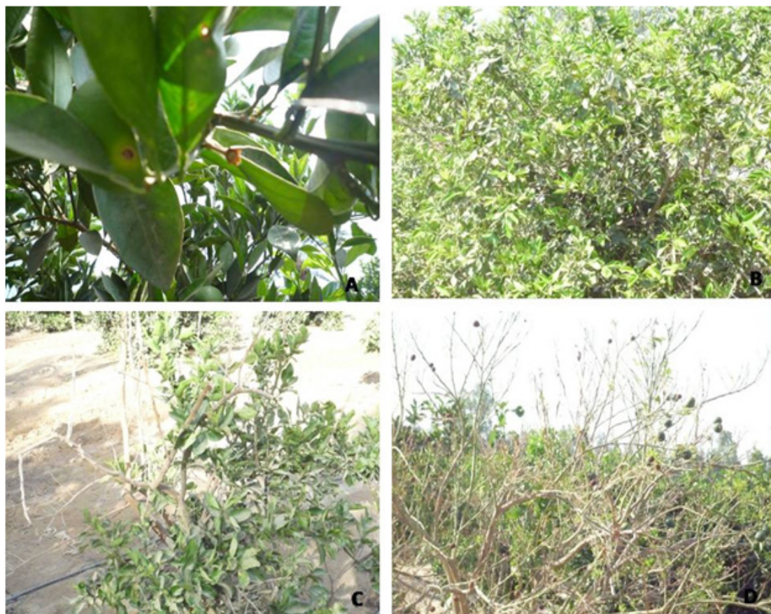
Fig. 3. Effect of soil alkalinity (pH: 8.7) and salinity of irrigation water (2500 ppm) on growth and fruits of Citrus sinensis in Wadi El-Natrun (Beheira Governorate, Egypt), where (A) normal plant, (B) fall leaves from the end of new branches (C) some branches drop all their leaves and (D) all branches drop all their leaves. A distinguished change in salinity of soil and water has been recorded due to changes in climate during last few years causing a loss by several million dollars in Egypt.

also different new contaminants (Lodeiro et al. 2016; Hashmi et al. 2017). Different pollutants should be removed from different environments including soil, water, air and ecosystem within various technologies of remediation.