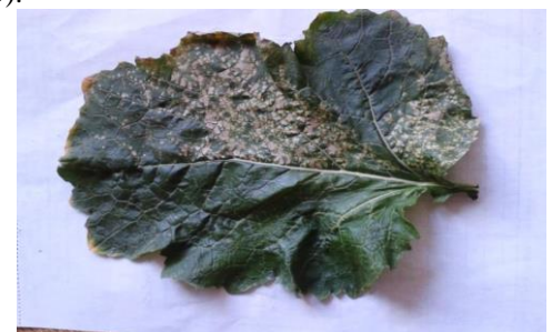
Fig 1. visual symptoms of toxicity on indian mustard leaves due to application of 4.5 mmol EDTA kg<sup>-1</sup>soil.

chlorophyll content by reducing oxidative stress and enhancing antioxidant enzyme activities (Zaheer et al. , 2015).