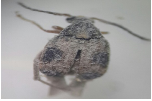
(A) Dorsal view

Mortality effect of nano silica (NSPs) was far more effective on adults and this mortality could be attributed to the impairment of the digestive tract or to surface enlargement of the integument as a consequence of dehydration or blockage of spiracles and tracheas. Also, it refers to their enormously increased exposed surfaces which could interact with the insect cuticle. Damage occurs to the insects' protective wax coat on the cuticle, both by sorption and abrasion.