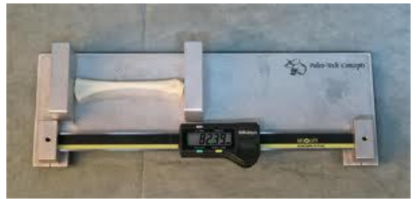
Figure (2): Digital caliper having 0.01 millimeter (mm) sensitivity (Mitutoya).

3- Foot Heel breadth (FHB) The maximum distance from the most protruding point on the medial surface of the heel to the corresponding protrusion on the lateral surface of the heel.