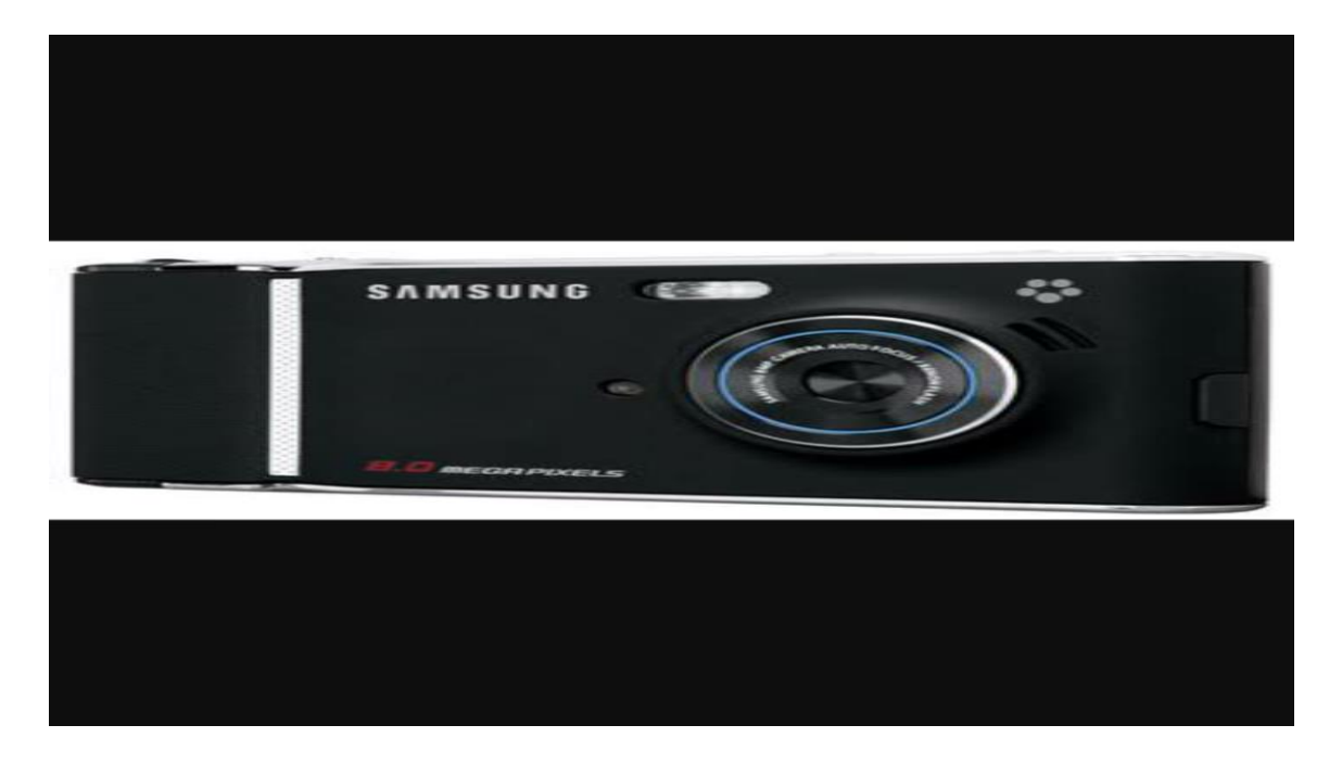
Figure (3): Samsung 8 megapexil camera.

constant distance (30 cm) then to obtain the most accurate approximation of the print, the scanned images were edited using the Photoshop1 on a computer.