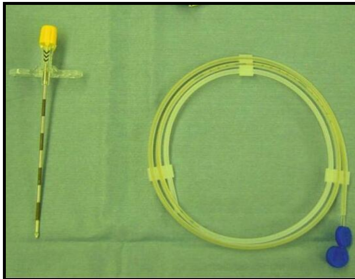
Figure (1) : Showing Racz needle

All patients were informed that a transient increase in a radicular pain may occur in the first 7 days.