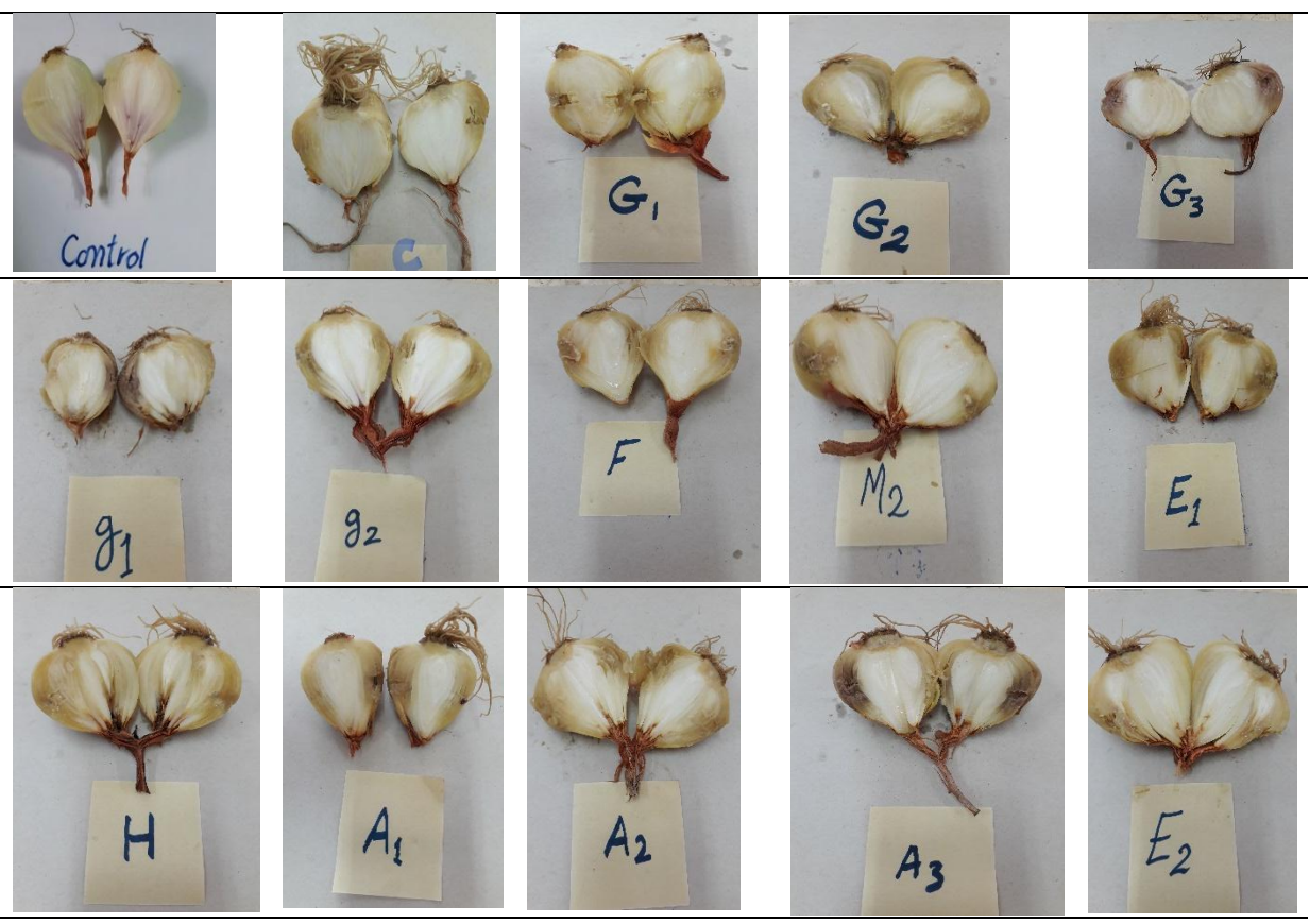
Figure 4. Virulence symptoms of fourteen Fusarium isolates on onion bulbs as rot symptoms G2,G3,g1,g2,F,M2,E1,H,A1,E2= F .oxysporum A2,A3,C= F .proliferatum G1= F .solani