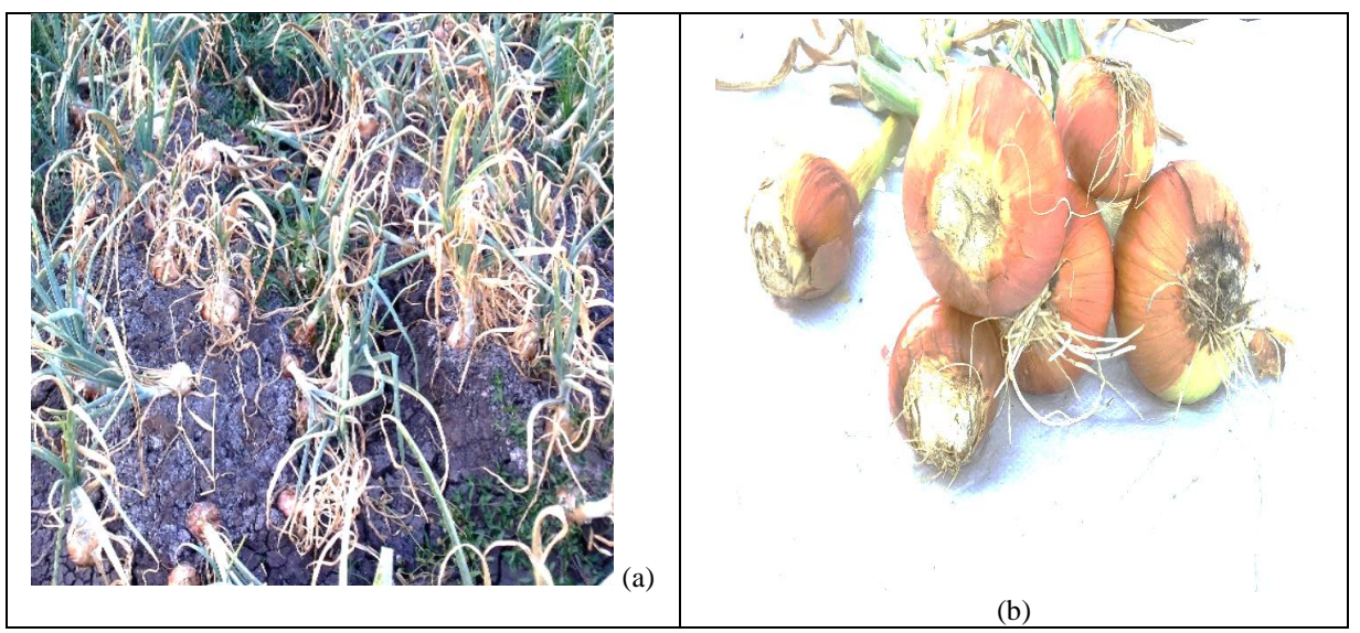
Figure 1. Symptoms of Fusarium basal rot of onion on leaves (a) and on the roots (b).