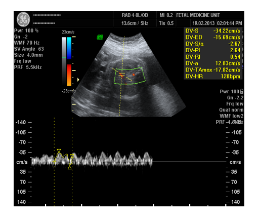
Figure (1): Ductus venosus PI in diabetic patient with myocardial hypertrophy

The tricuspid E/A ratio in group I range from 0.62-0.76 (mean 0.69 \pm 0.05). The tricuspid E/A ratio in group II range from 0.65-0.76 (mean 0.71 \pm 0.03). The tricuspid E/A ratio in group III range from 0.49-0.78 (mean 0.68 \pm 0.01). When applying the ANOVA, the tricuspid E/A ratios were non significant between the three groups (P = 0.19).