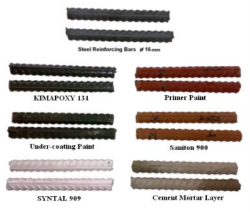
Figure 2. Reinforcing Bars of 16 mm Diameter which Coated using Different Types of Coating Materials Used.

Table 7. Dimensions of Reinforcing Bar before Corrosion.