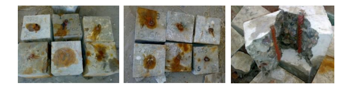
Figure 4. Embedded Reinforcing Bars after Corrosion.

It was noted that the decrease in dimensions were maximum when the steel rebars were not protected or coated with cement mortar. The protected rebars performed in a preferable manner than those not protected as shown in Table (8). The test results indicated that, the best recorded results were obtained for rebars protected with primer coating paint and Saniton 900 followed by KIMAPOXY 131 then SYNTAL 909 and finally for the rebars protected by under coat anti-rust coating paint.