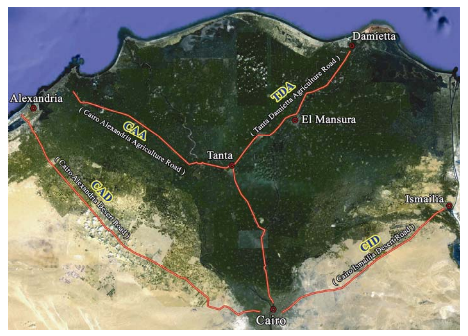
Figure 1: Map of roads included in the study

The selected sections have flexible pavement type, variation in traffic characteristics and pavement conditions. Figure 1 shows the roads included in the study.