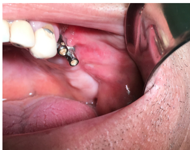
Fig. 4: Showing the healed surgical site after 1 month of closure utilizing buccal fat pad technique

Panoramic radiographs showed an evidence of bone formation in all the patients of group A and in zero patients in group B after 3 months postoperatively (Fig. 5, 6).