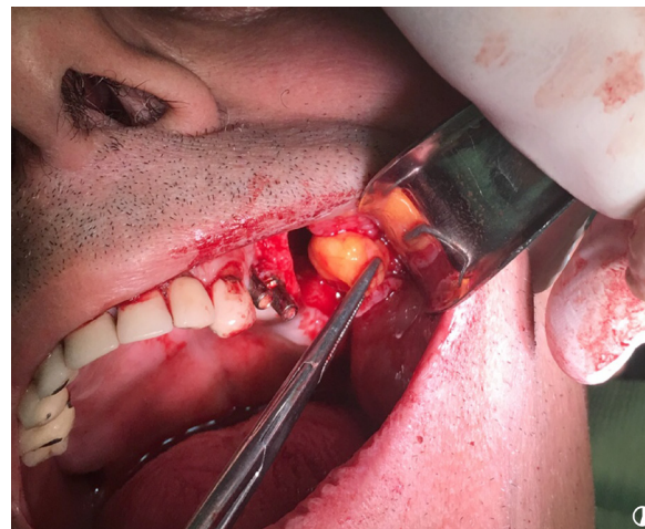
Fig. 2: Showing the buccal pad of fat accessed and advanced towards the defect.

bony defect and sutured in place using 4-0 vicryl sutures (Fig. 3). The flap was repositioned to cover the fatty tissue and was sutured in place.