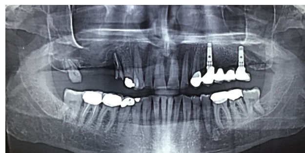
Fig. 6: Panoramic radiograph showing evidence of bone formation after 3 months from placing the sandwiched graft and closing the oroantral communication