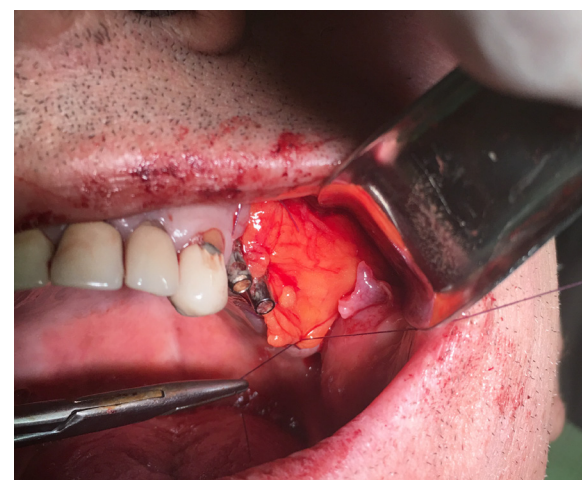
Fig. 3: Showing the buccal pad of fat covering the defect and sutured in place