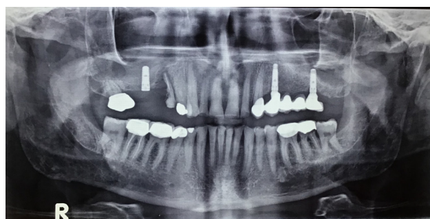
Fig. 5: Panoramic radiograph showing a failed dental implant perforating the maxillary sinus resulting in oroantral communication after removal

Panoramic radiographs showed an evidence of bone formation in all the patients of group A and in zero patients in group B after 3 months postoperatively (Fig. 5, 6).