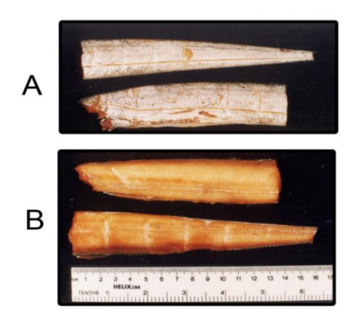
Fig.(2):General appearance of smoked largehead hairtail fish.

Means in a row not sharing the same letter are significantly different at P \leq 0.05