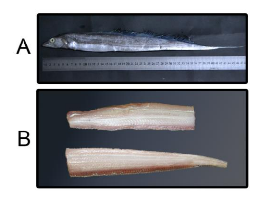
Fig. (1): General appearance of whole fresh (A) and dressed (B) largehead hairtail fish.

The smoking program included three stages drying at 30°C for 30 min, cooking at 50°C for 45 min and intensive hot smoking at 85°C for 50 min. The obtained smoked steaks were cooled at room temperature, packed in low density polyethylene bags, heat sealed under vacuum, quick frozen in an air blast freezer at -30°C and finally stored at -18°C until used.